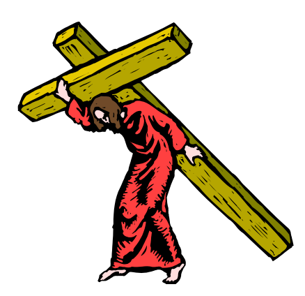
A Traditional Way of the Cross

The Way of the Cross (Stations of the Cross, Via Dolorosa, Via Crucis, Devotion to Jesus)